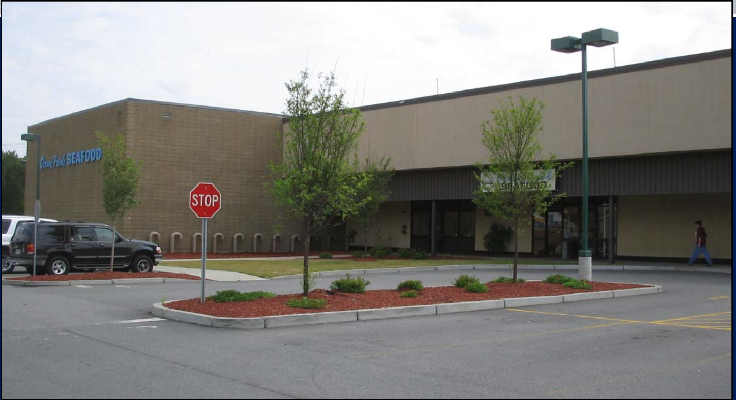
The former Ocean Fresh Seafood