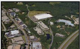
Norton Commerce Center Norton, MA

120,000 to 480,000 SF of newly constructed, modern, high bay, tilt-up concrete distribution center located on Route 2A in Littleton, MA. The project, located just off of Route 495, is subdividable and pre-permitted for additional build out.