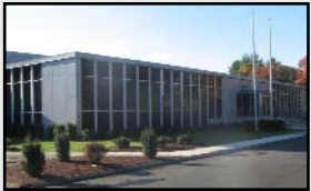
160 Dascomb Road Andover, MA

70,000 SF of flex warehouse space available just off of Route 93. 40,000 SF of this availability is newly constructed, high bay warehouse space along with 30,000 SF of fully renovated warehouse/flex space. Availability is subdividable to fit all requirements and would be ideal for a manufacturing or lab tenant.