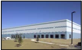
Littleton Distribution Center Littleton, MA

70,000 SF of flex warehouse space available just off of Route 93. 40,000 SF of this availability is newly constructed, high bay warehouse space along with 30,000 SF of fully renovated warehouse/flex space. Availability is subdividable to fit all requirements and would be ideal for a manufacturing or lab tenant.