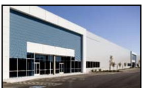
Crossroads Commerce Center Taunton, MA

14 & 4 acre land sites located just off of Route 495. Sites can support up to 130,000 SF and 20,000 SF buildings respectively. All utilities available, located at two of Southern Massachusetts most high profile industrial parks.